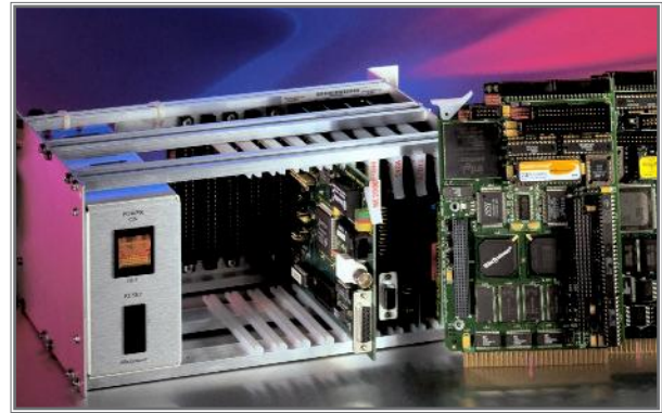
WinSystems' STD Bus Card Cage and Boards

WinSystems also offers card cages with 50W or 100W power supplies. These are triple output, high-efficiency supplies that mount inside the card cage. They are universal input switchers that accept a range of 85 to 220VAC. An ON/OFF switch and momentary Reset switch are mounted on a panel for operator convenience.