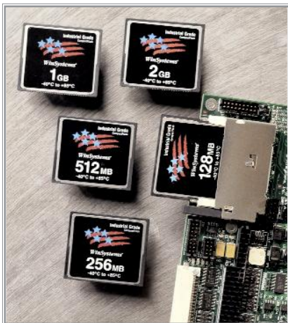
WinSystems' Industrial CompactFlash Cards

Memory - The board supports up to 1GB of 64-bit wide DDR-1 terminated 200MHz Synchronous DRAM that plugs into a 200-pin socket on the back of the board. The board is shipped from the factory with no memory installed. A 200-pin SODIMM connector permits the user to either install and/or upgrade the memory capacity in the field. WinSystems can supply the SODIMM200-G-27-128, -256, -512, and -1G which are 128MB, 256MB, 512MB, and 1GB RoHS-compliant memory modules qualified for use on this board.