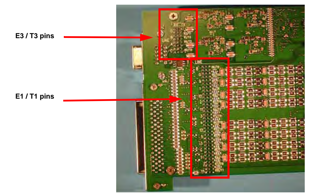
Figure 1. Combo and Combo 2 – Pin Locations and Legends

Figure 2 shows the front of a Combo or Combo 2 board, with all channels set to transmit.