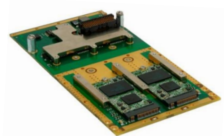
Conduction-cooled Build Option: 2 x M.2 Devices Fitted