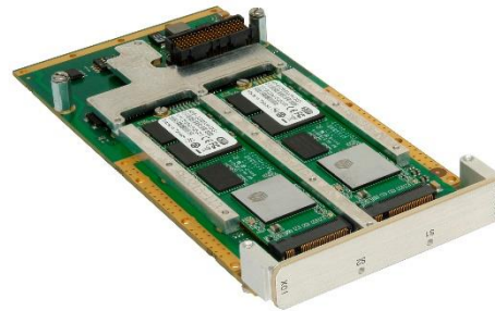
Air-cooled Build Option: 2 x M.2 Devices Fitted